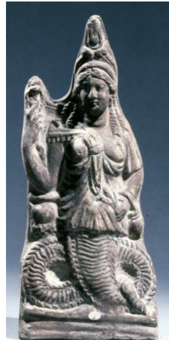
Isis Ermouthis, a serpent form, from Paym, Fayum.