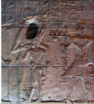
Isis defaced, under the new order

1992: 111] It was in Egypt and other centers of the Mysteries that the last stand for open Goddess worship was fought, and ultimately lost, on the battleground of Gnosticism.