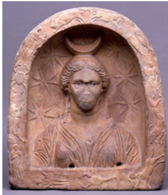
Goddess crowned by moon and surrounded by stars in a zodiacal naos, Argos, Greece, late pagan era.

More background on Khokhmah can be found in this earlier version: http://www.suppressedhistories.net/articles/sophia.html