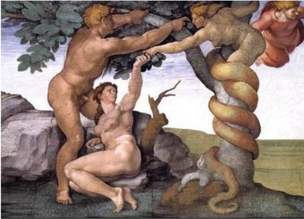
Snake Goddess Gives Eve Fruit from the Tree of Knowledge. Michaelangelo's Sistine Chapel painting is one of several European representations of the Serpent as a woman, long after the Gnostic era.

Although this text has been Christianized, it still shows a goddess as the major force in creation. It restores Eve to her primordial sacred status as the Mother of All Living. Negative comments about the male creator are embedded in the beginning and end of this text, but conflict with its main thrust. Its author is keenly aware of the Genesis account, but poses a counter-interpretation. The biblical name for god, Elohim, is taken as a plural indicating multiple entities (rather than the ending -im acting as a grammatical intensifier). This text uses elohim to stand for the archons (elemental powers).